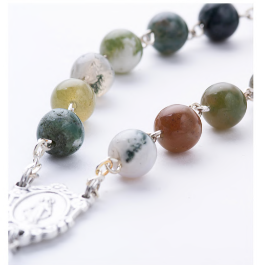
RVP6 - RVP8 - BRPV