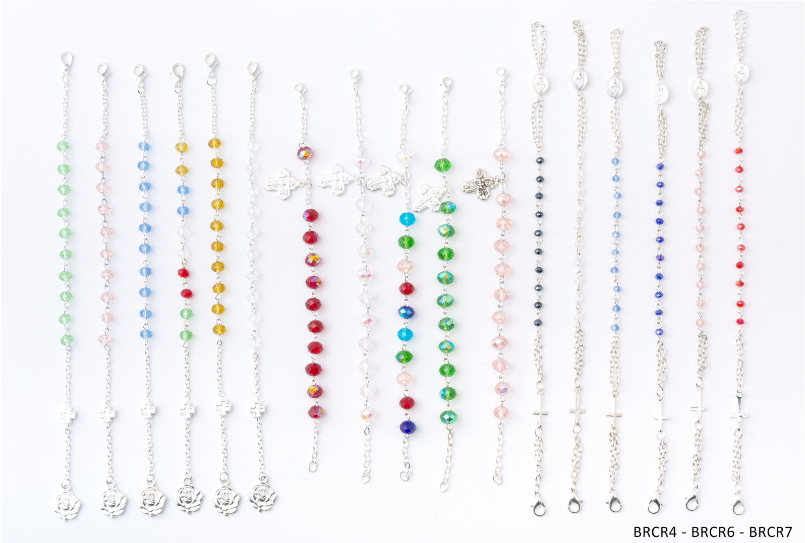
BRCR4 - BRCR6 - BRCR7