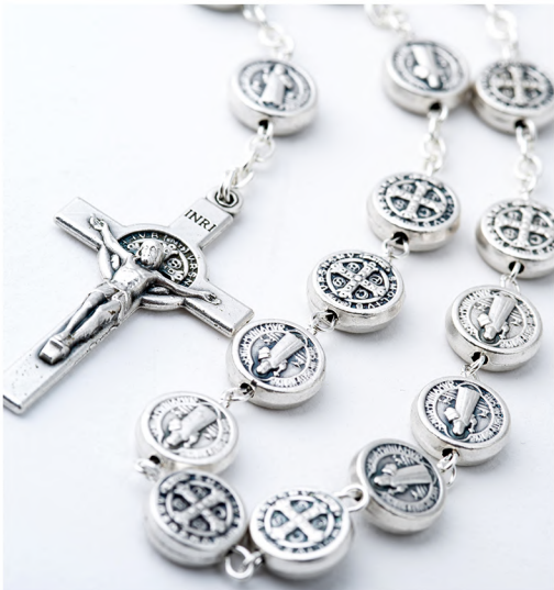
RZSB - RZPSB - BRSB - DCSB+M