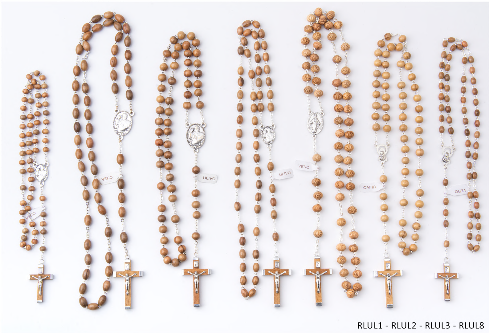
RLUL1 - RLUL2 - RLUL3 - RLUL8