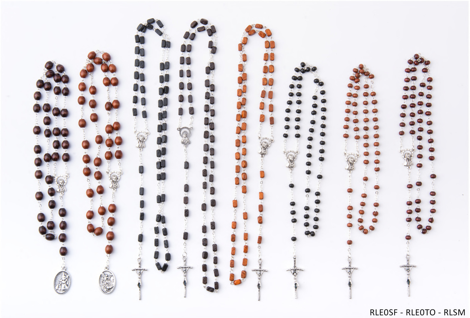
RLEOSF - RLEOTO - RL5M