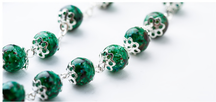
RMAC8C - RMAC6 - BRMAC