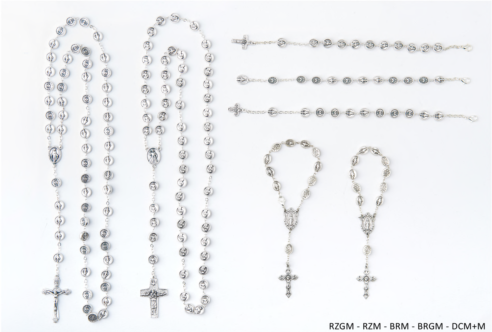
RZGM - RZM - BRM - BRGM - DCM+M