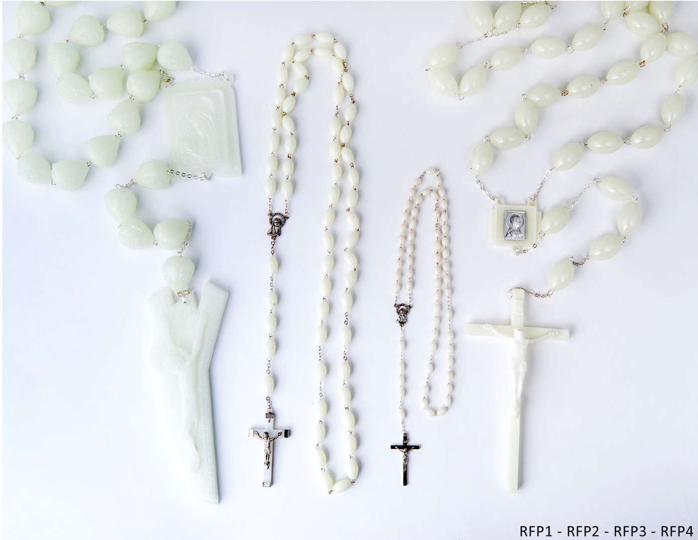
RFP1 - RFP2 - RFP3 - RFP4