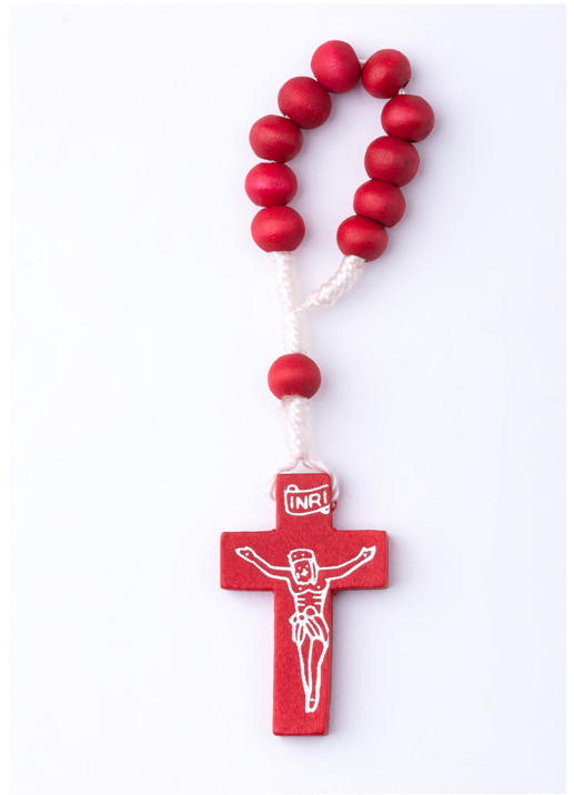
RLF6 - RLF6DC