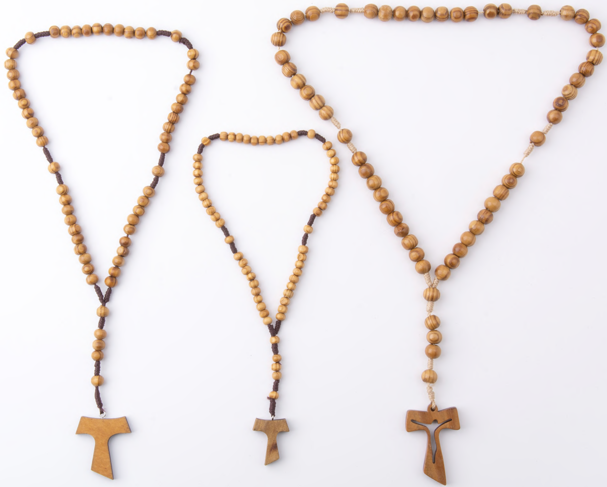
RFP 1 - RFP 2 - RFP3