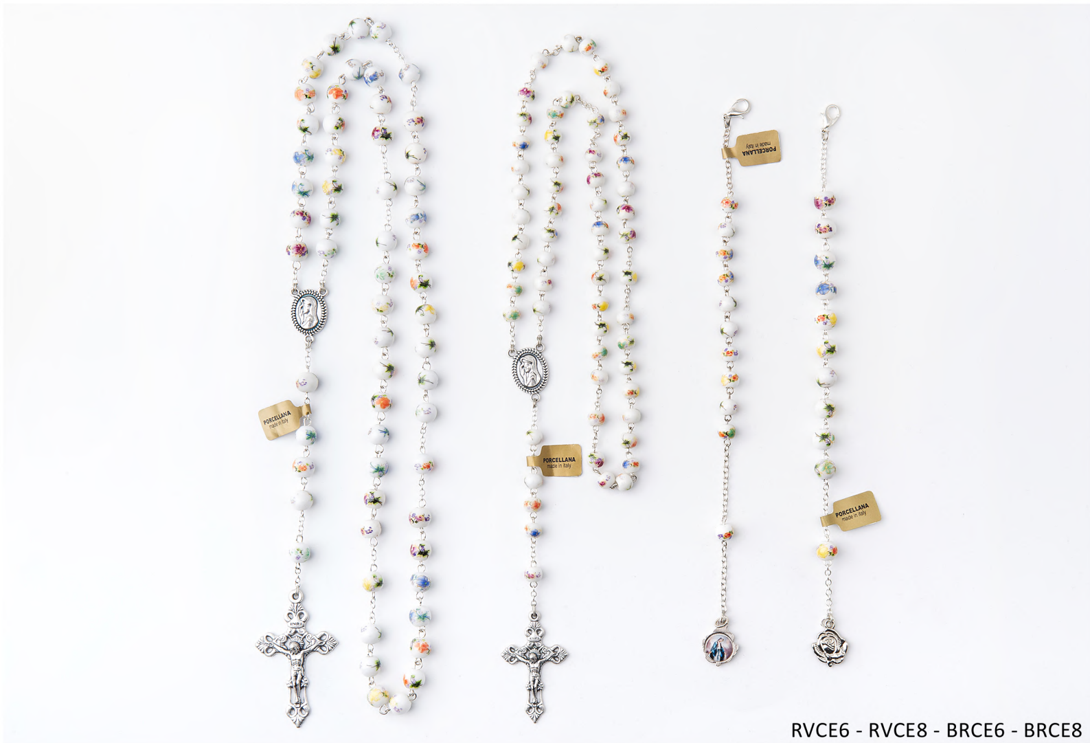
RVCE6 - RVCE8 - BRCE6 - BRCE8