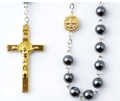
REM6 - REM5B - BRE5B - BREM