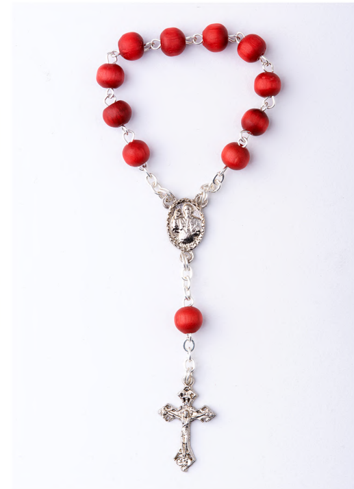
DCPE - RLPE6 - RLPE6L4B - RLPE6R