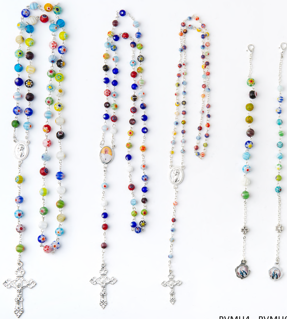
RVMU4 - RVMU6 - RVMU8 - BRMU6 - BRMU8