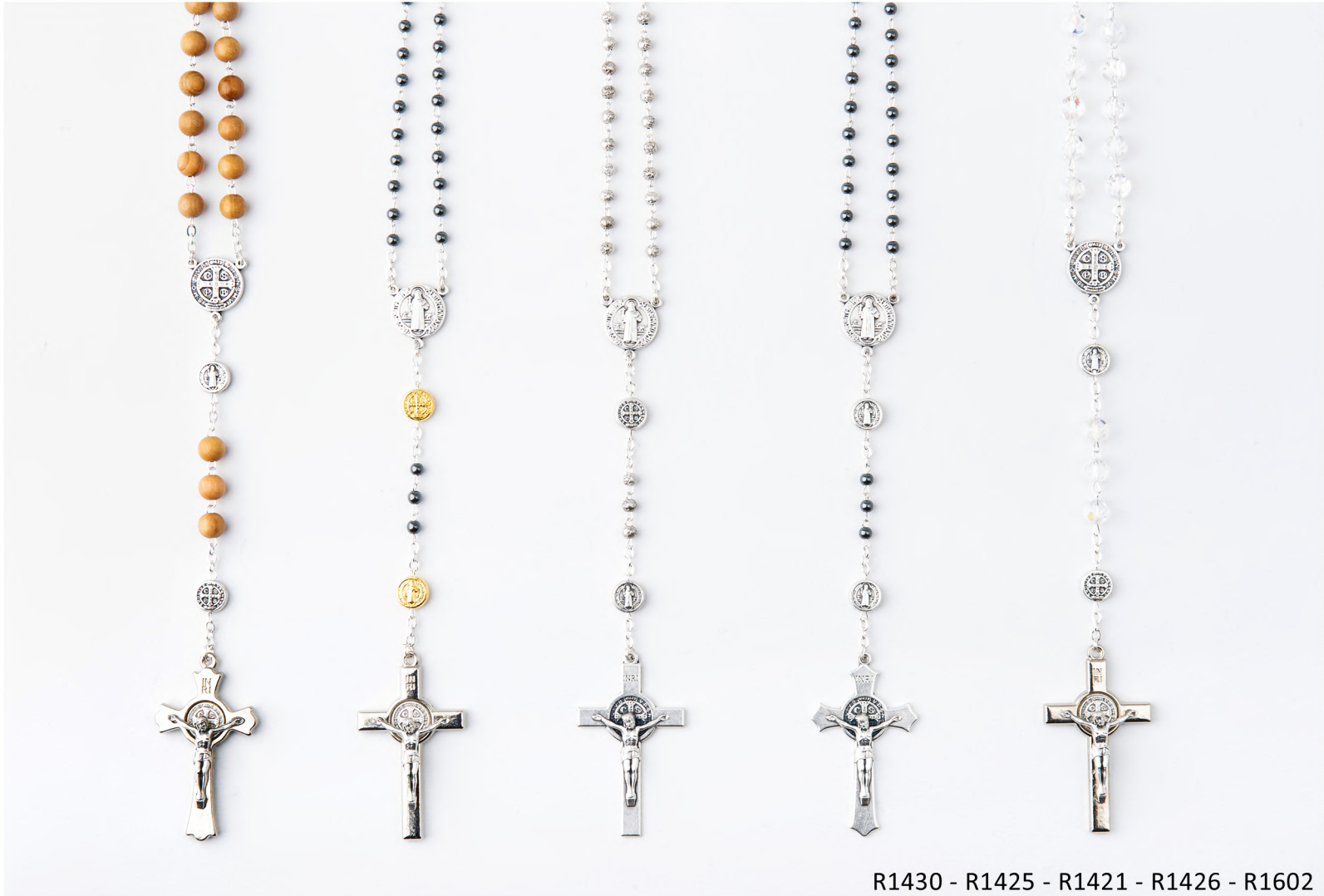
R1430 - R1425 - R1421 - R1426 - R1602