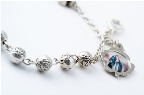
RZ6ST - RZ6STD - BR6STZ