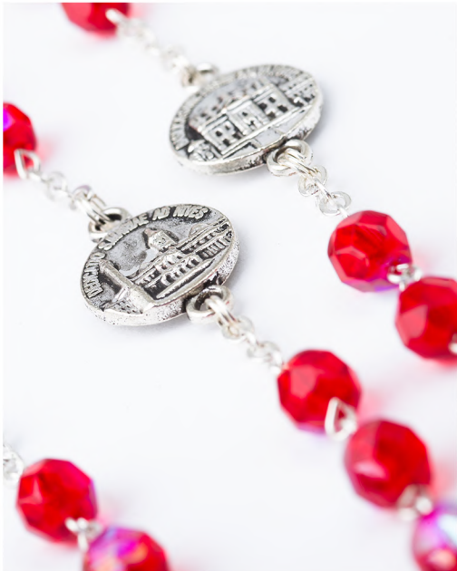
RVCR6/4B - RVCR7/4B