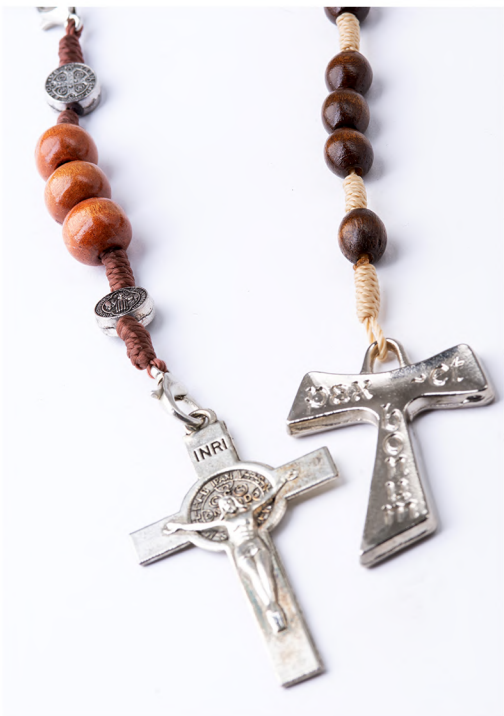
RFSB 1 - RFSB 2 - RFTAU