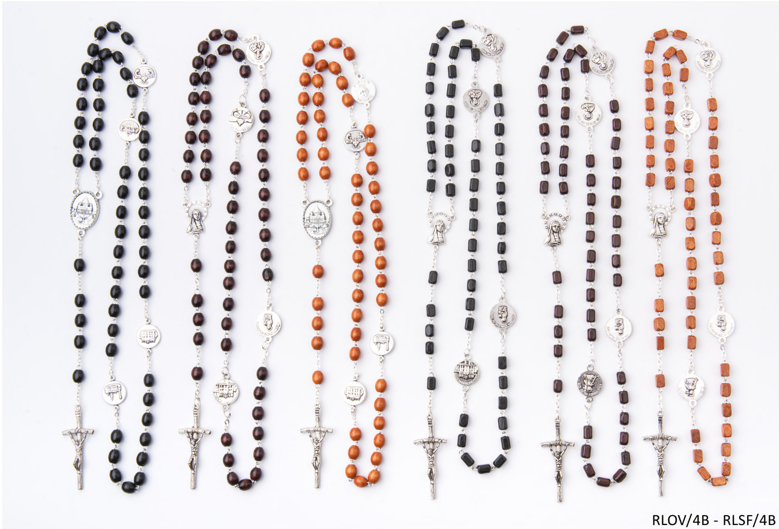
RLOV/4B - RLSF/4B