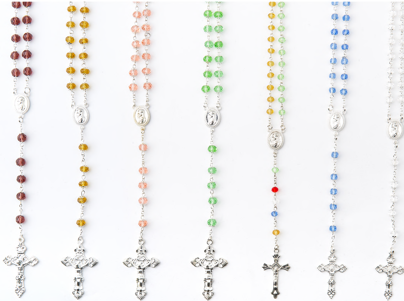
RVCR8 - RVCR6