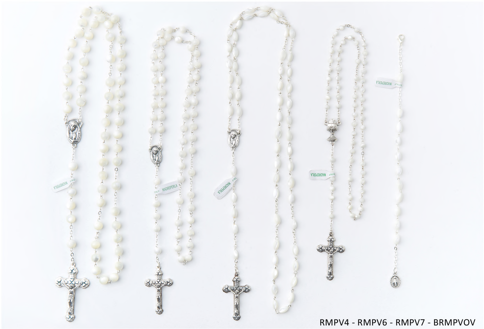
RMPV4 - RMPV6 - RMPV7 - BRMPVOV