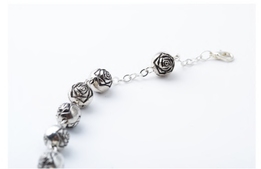
RST6/4B - RST8/4B - BRST6 - BRST8