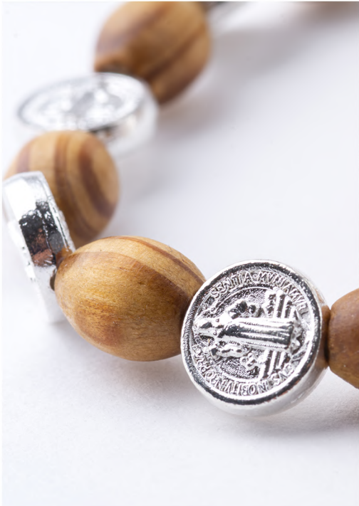
BRCCP - BREL