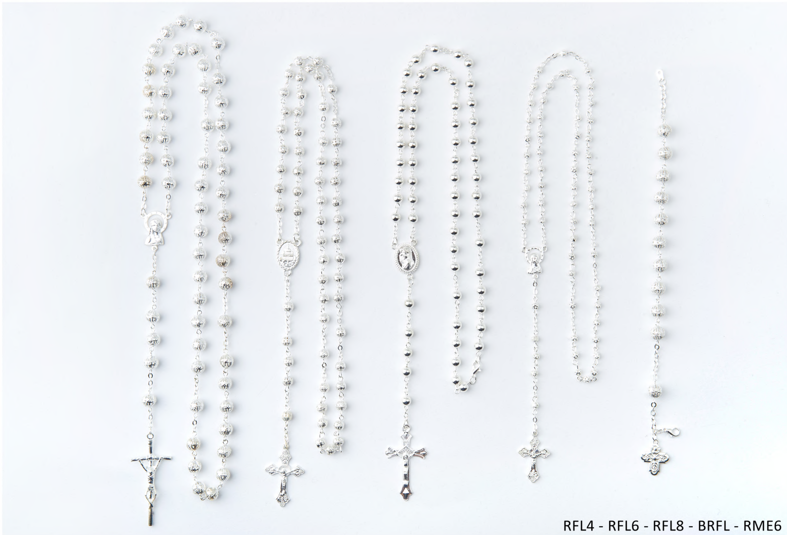
RFL4 - RFL6 - RFL8 - BRFL - RME6