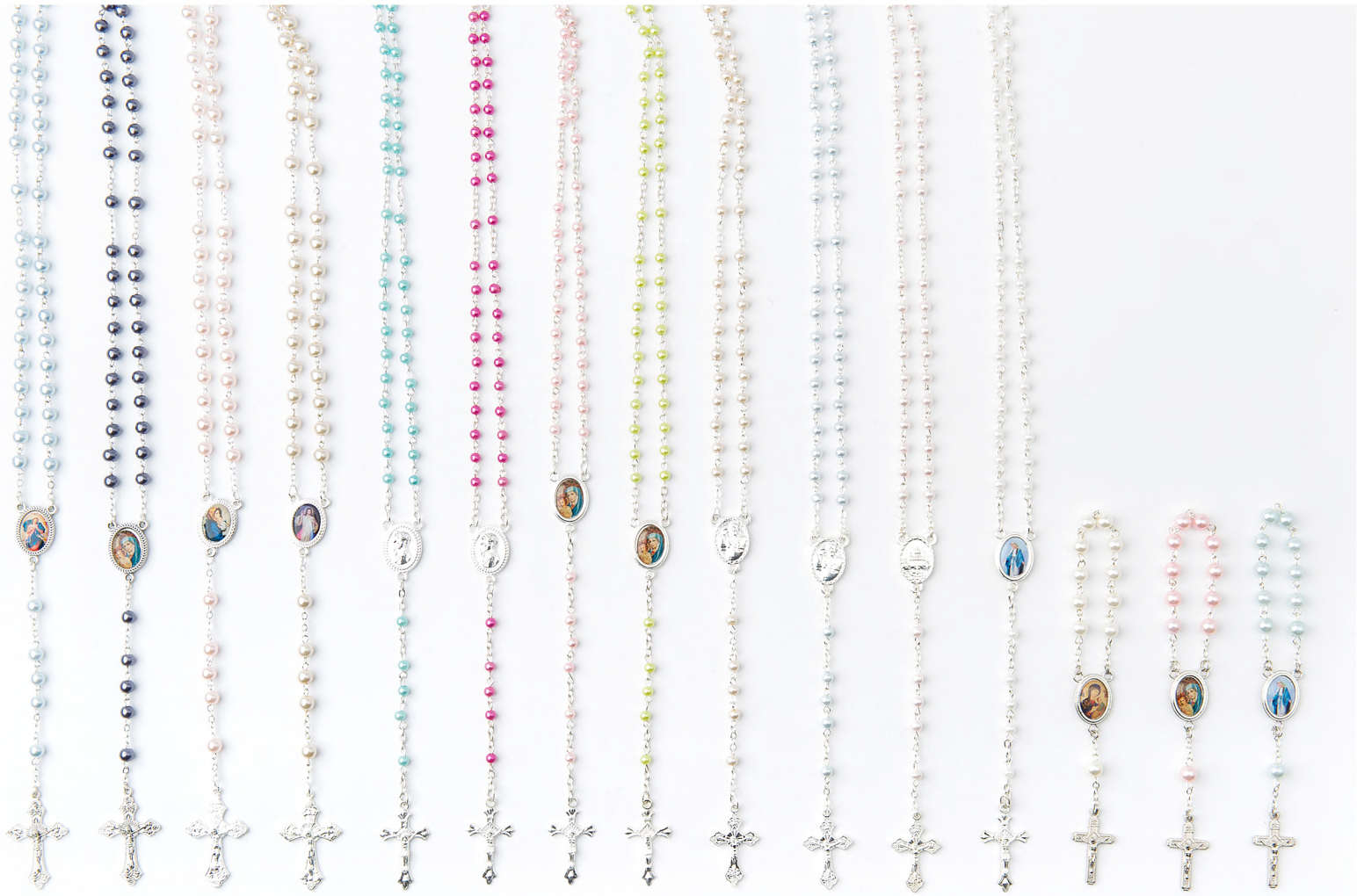
RP4 - RP4S - RP5 - DCP