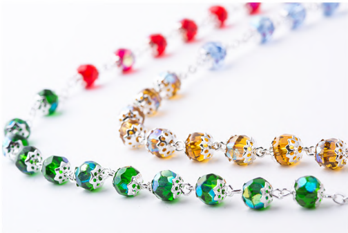
RCR6C - RCR7C