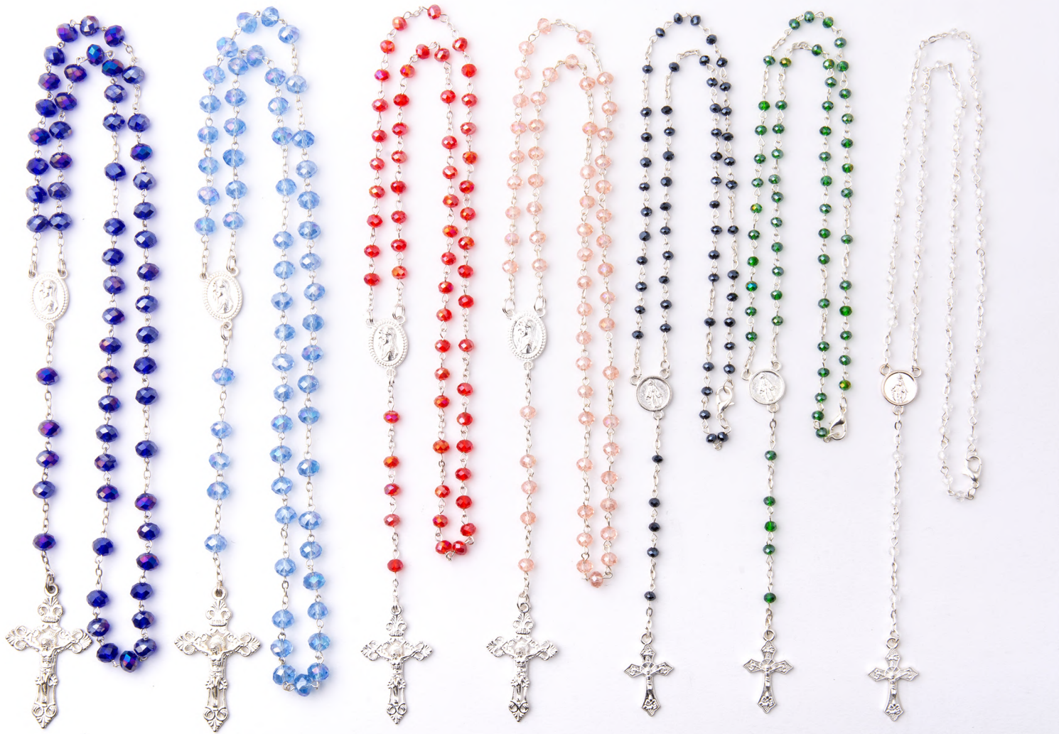
RCD4 - RCD6 - RCD8